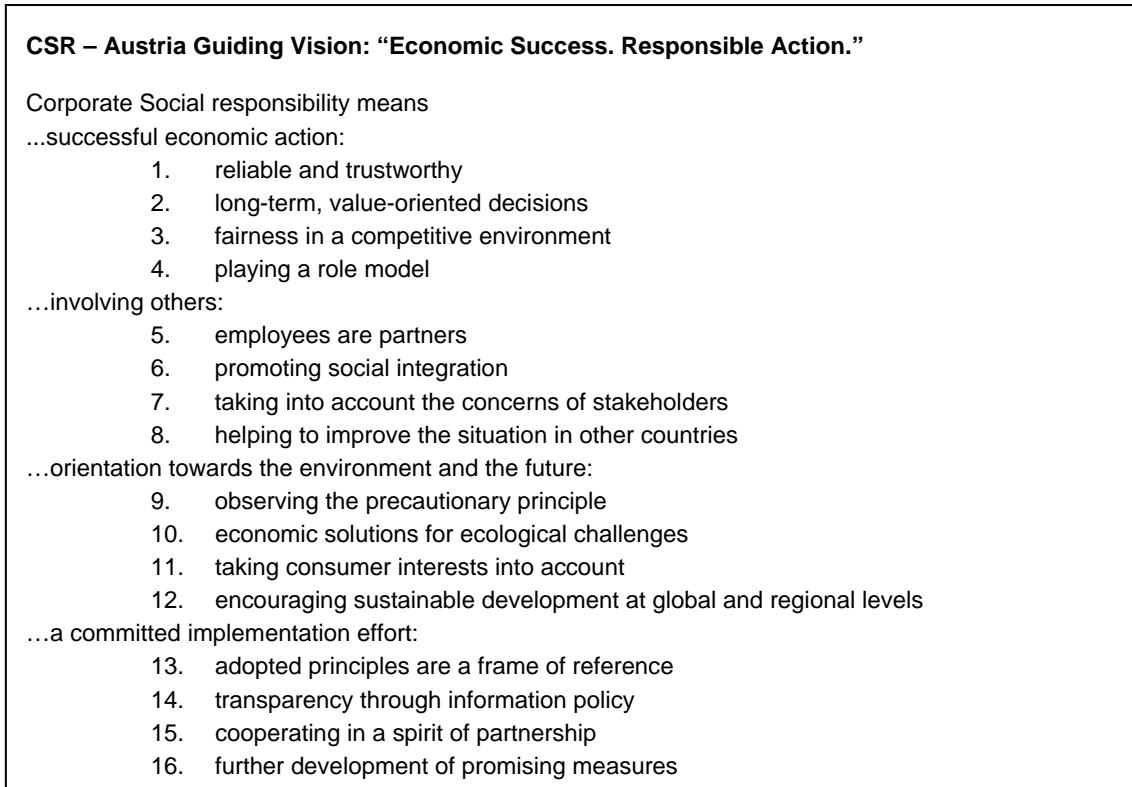
Diagram 2: CSR guiding vision: The 16 CSR principles of the Austrian Industry

The second step was the formulation of Austrian CSR-Guiding Visions building upon the Green Paper and other international texts (f.e. the OECD Guidelines for Multinational Enterprises) and on the special experiences, expectations and needs of Austrian companies and Austrian society at large. Following the Austrian tradition of social partnership the elaboration of the Guiding Visions involves a broad dialogue with representatives of all sectors of civil society. At the CSR-Conference end of September 2003 around 120 members from business, Non-Governmental-Organizations (NGOs), social partners, and international organizations discussed the first draft of the CSR-Guiding Visions for the Austrian Business-Community. The finalized CSR-Guiding Vision "Economic Success. Responsible Action." was presented in December 2003 in Vienna. The concept of responsible entrepreneurship stands for companies that exercise their activities in a manner to promote economic growth, to increase competitiveness and at the same moment to act environmentally sound and socially responsible. The developed 16 CSR principles of the Austrian Industry are listed in the next diagram.